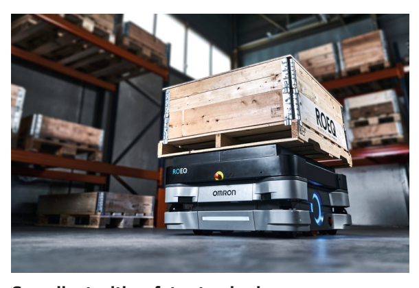
Compliant with safety standards: ISO 3691-4:2020 Driverless Industrial trucks